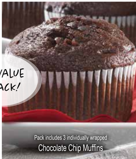
Pack includes 3 individually wrapped Chocolate Chip Muffins