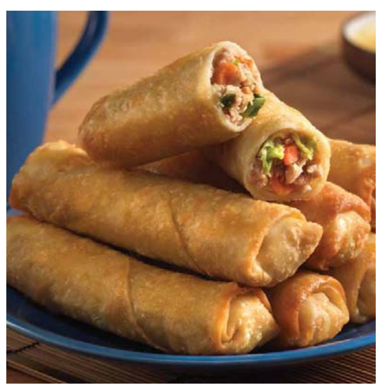
EGG ROLLS | ROLLOS DE HUEVO Crispy, crunchy, quick and easy to make. Filled with shredded pork and veggies. Microwavable. (8/pkg - 24 oz.)