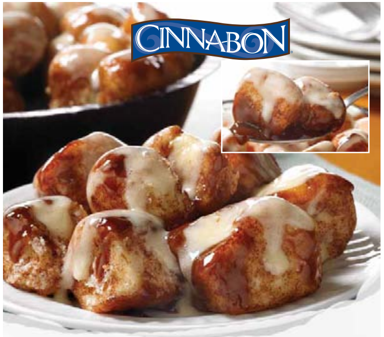
CINNABON® GOOEY BITES™ and the Cinnabon Logo are trademarks of Cinnabon, Inc.