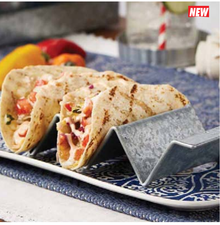
GALVANIZED TACO HOLDER ENVASE DE METAL GALVANIZADO PARA TACOS Add a rustic flair to your next fiesta with a food-safe galvanized metal serving tray. 9.75" L x 4"W with 2" deep taco or pita holders. Hand wash only.