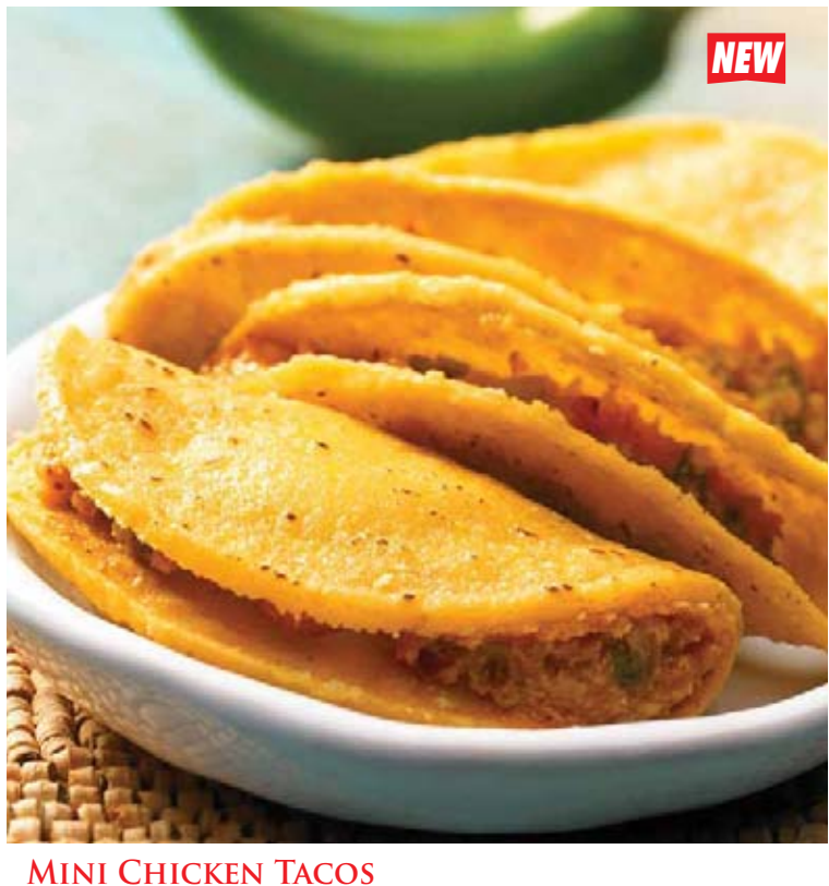
MINITACOS DE POLLO Mini tacos with a blend of onions, spices of red chili and pea-size chunks of chicken wrapped in a corn tortilla. Toss with hot sauce or serve as an appetizer with dipping sauces. (approx. 23 - 25 tacos per container)