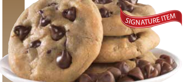
#550 SIGNATURE TEM

24 Ct White Chocolate Macadamia Nut Cookie Dough