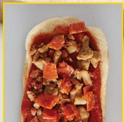
Delicious Diced Meat