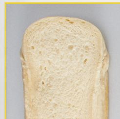
High Protein French Bread

Frozen Food... Fresh Ingredients — Only available here!