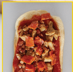
Delicious Diced Meat