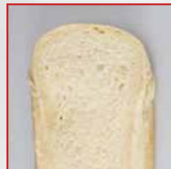
High Protein French Bread

Frozen Food... Fresh Ingredients — Only available here!