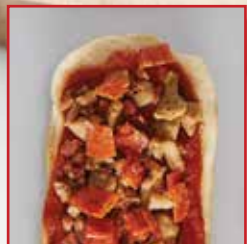
Diced Meat or Extra Cheese