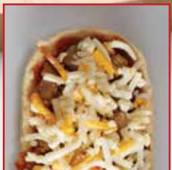
Real WI Cheese

Made with the best locally sourced ingredients!