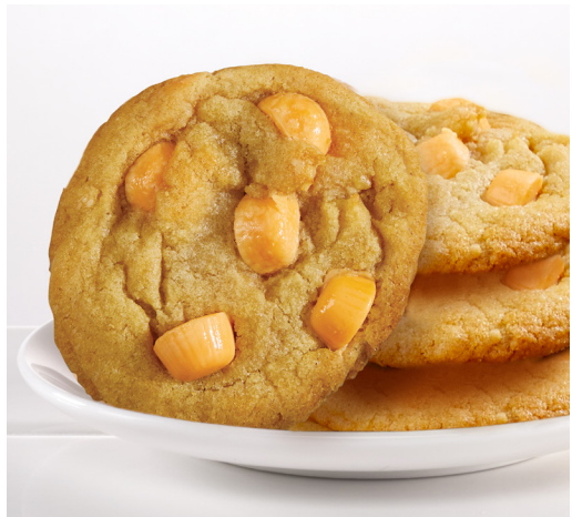
218 ● $23.00 ORANGE CRÈME (Masa para galletas con trocitos de crema de naranja y vainilla) 2 Lb. Box