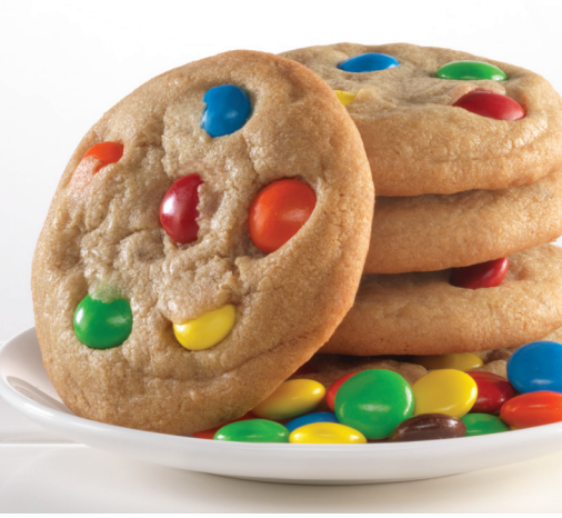
365 ● $23.00 CANDY (Masa de galleta con trozos de chocolate) 2.5 Lb. Box