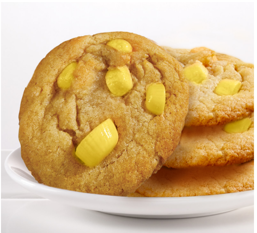
219 ● $23.00 LEMON BLISS (Masa para galletas con trocitos de limón) 2 Lb. Box