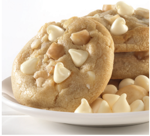
366 ● $23.00 WHITE CHOCOLATE MAC (Chocolate blanco y nuez de Macadamia) 2.5 Lb. Box