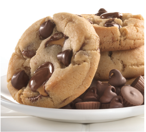
367 ● $23.00 PEANUT BUTTER CUP (Masa para galletas de mantequilla de maní y chocolate) 2.5 Lb. Box