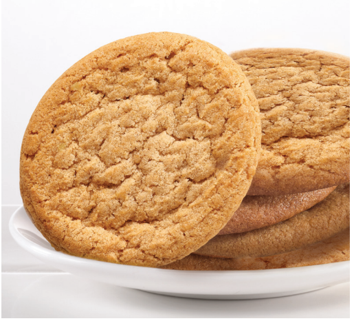
363 ● $23.00 SNICKERDOODLE (Canela y azúcar) 2.5 Lb. Box