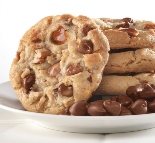
368 ● $23.00 MILK CHOCOLATE PECAN (Chocolate de leche con pacana) 2.5 Lb. Box