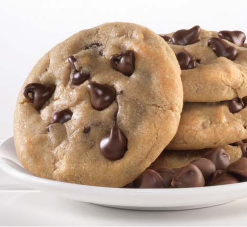
361 ● $23.00 CHOCOLATE CHIP (Chispas de chocolate) 2.5 Lb. Box