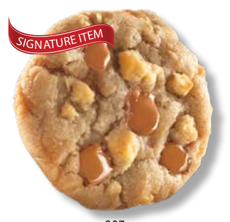
307 CARAMEL APPLE PIE

(Masa para galleta con el sabor de tarta de manzana y caramelo) All the tastes of caramel and apple for a flavor packed cookie. Serve warm with a scoop of ice cream. Yummmm! (2.5 lb. box; 36 - 1.1 oz. pucks)