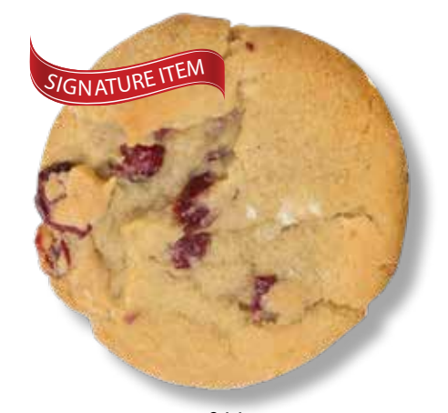
316 WHITE CHOCOLATE CRANBERRY

(Masa de galleta de chocolate blanco de arándano) These white chocolate cranberry cookies take two delicious flavors and combine them into a soft, chewy cookie that everyone will enjoy. (2.5 lb. - 2.5 lb. box; 36 - 1.1 oz. pucks)