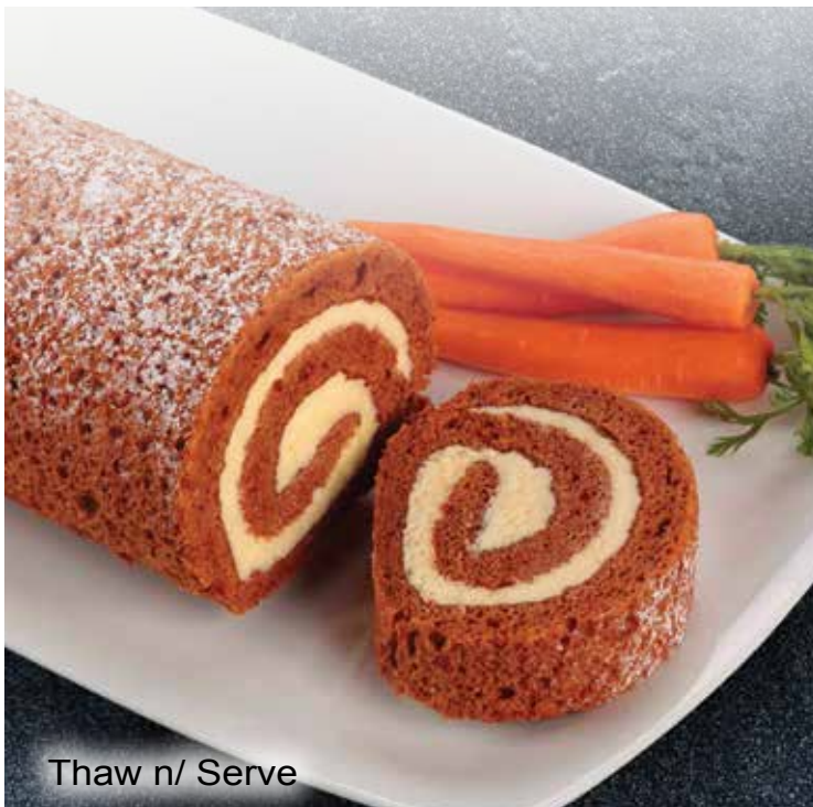
Thaw n/ Serve