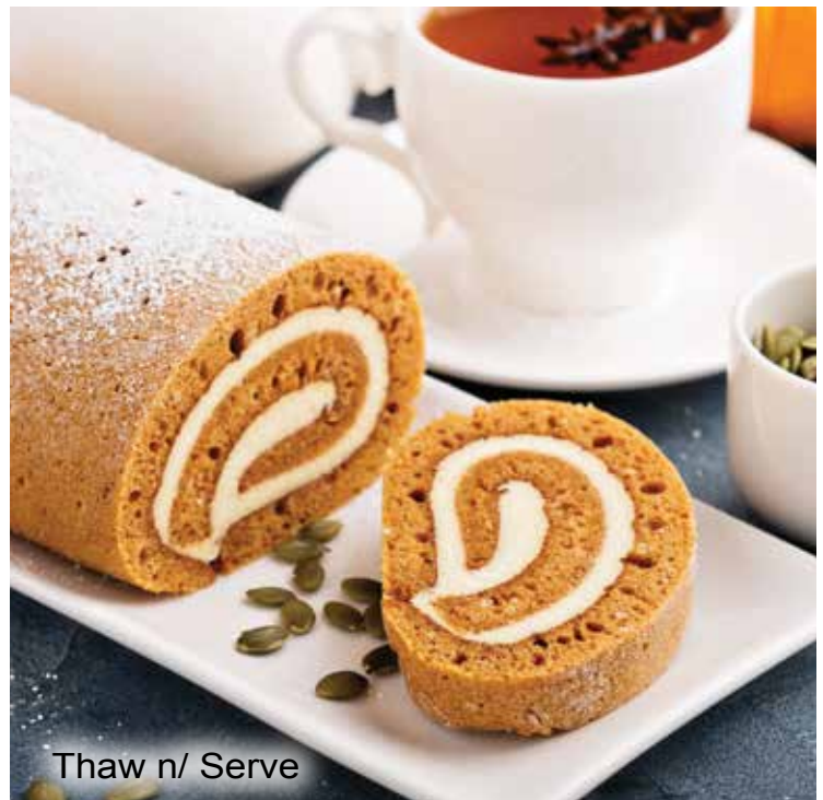
Thaw n/ Serve

(Rollo de pastel zanahoria con crema de queso crema) Sweet, rich and flavorful! This spiced carrot cake with a sweet butter cream filling makes this dessert a special treat. Zero grams trans fat. (18 oz.) MADE IN THE USA ®