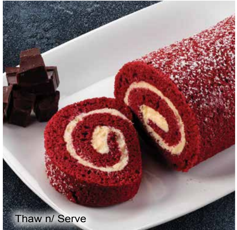
Thaw n/ Serve

(Rollo de pastel rojo con crema de queso crema) A beautifully deep rich color, our Red Velvet is the perfect dessert for any occasion. Sweet butter cream filled, moist and delicious. Zero grams trans fat. (18 oz.) MADE IN THE USA ®