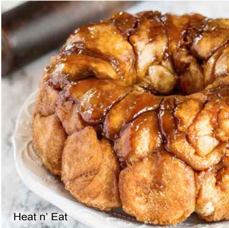
Heat n' Eat